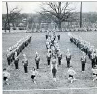
Last Marching Band Fall of 1966

This summer during the West Homecoming, former band members will have their own gathering Friday night for a dinner, or Saturday morning for a brunch.