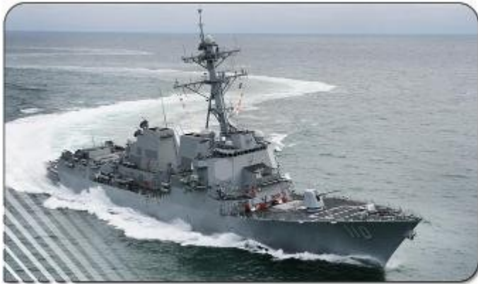
USS William P. Lawrence DDG-110

(Next issue-How did Four Leaf Clover ever become a fight song?)