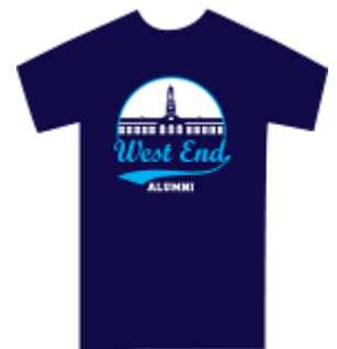
Yes Virginia, you can have your very own!

alice.plummer@comcast.net if you have not already done so.